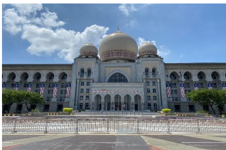
Palace of Justice, Putrajaya